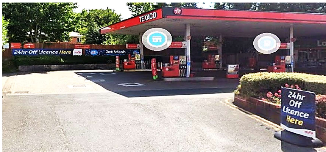
Below: The MFG station on the A35 at Winterbourne Abbas closes at 22.00.